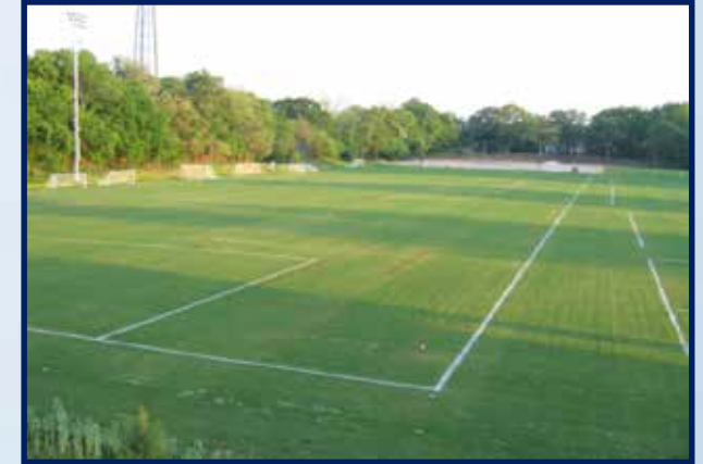
Atlanta Youth Soccer Association; Cleanup; 2004