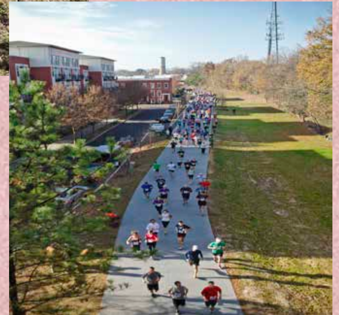
Atlanta Beltline Before and After

EPA's Superfund, Brownfields and Corrective Action programs have RAU Goals